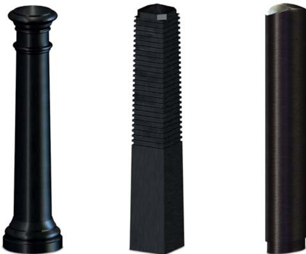
Manchester, Westminster and Waterside styles shown above

RhinoGuard Ferrocast bollards can be designed in almost any style to complement any landscape and meet individual project requirements. Bollards can be designed to recreate an existing traditional theme ideal for heritage sites, or to create a more unique contemporary styling. The Design Team at Marshalls Street Furniture will help to take a design from concept to manufacture. Tooling for bespoke designs is simple, easy and cost effective.